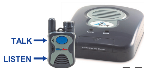
Up to Date Technology

MAGLIFE Personal Emergency Reporting System